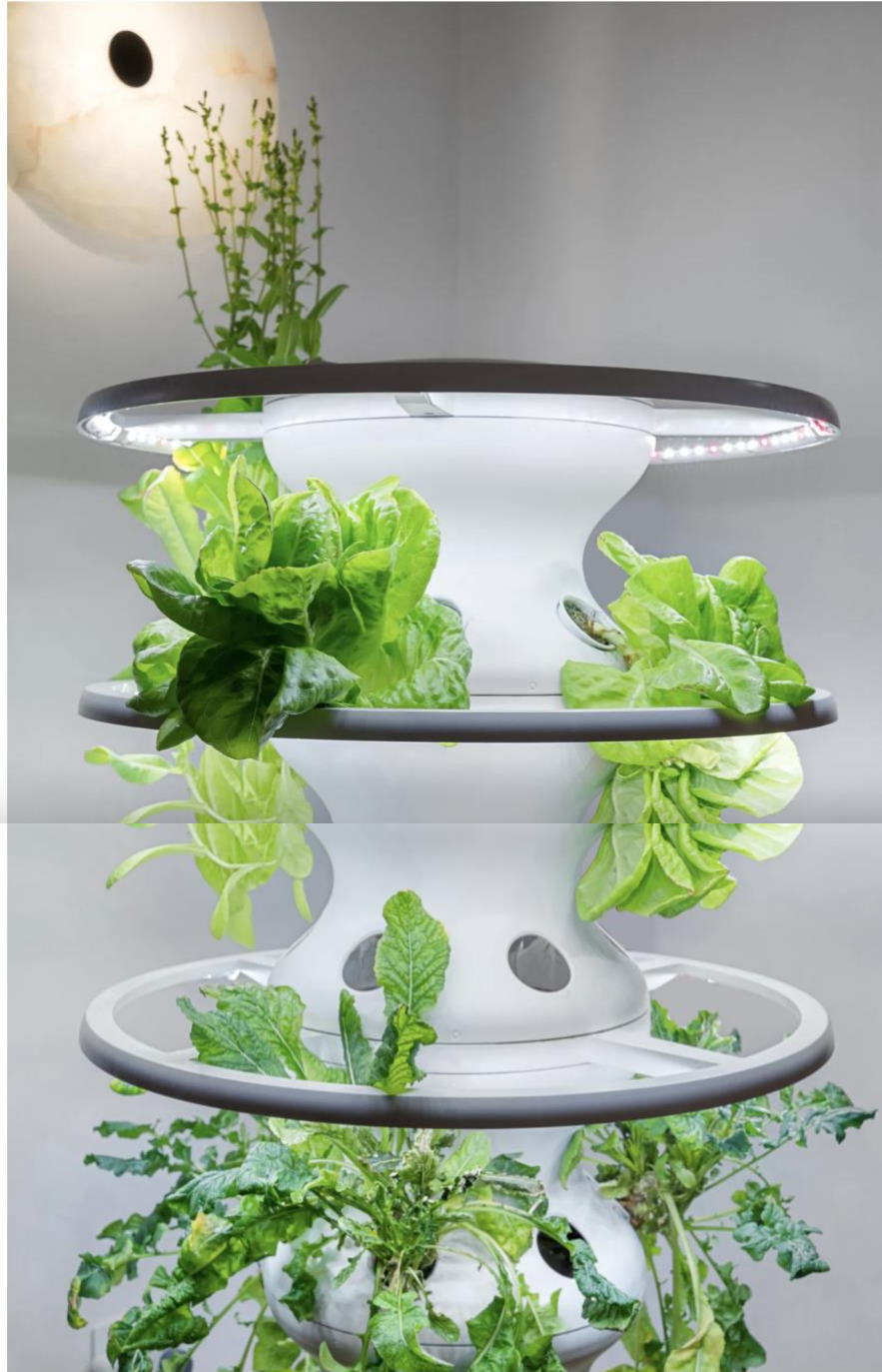
Small home vegetable garden at THE WELL Bay Harbor Islands residences designed by the Meyer Davis studio.