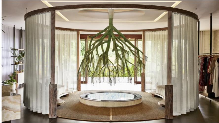
Nature becomes an integral part of the holistic design of The WELL clubs. Above wellness center at Hacienda AltaGracia.

In the area of infrastructure, The WELL Bay Harbor Islands optimizes HVAC, water and lighting systems, prioritizing the creation of an environment that puts well-being at the center. As part of holistic design, the interiors prefer shapes and materials that promote tranquility and harmony . Personalized services will be offered within the condominium thanks to new technological applications. 'The WELL Bay Harbor Islands' mission is to revolutionize the way people live and work, seamlessly integrating well- being into their daily lives,' continues Kane Sarhan .