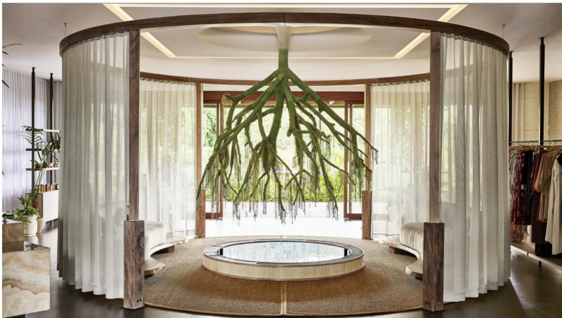
Nature becomes an integral part of the holistic design of The WELL clubs. Above wellness center at Hacienda AltaGracia.