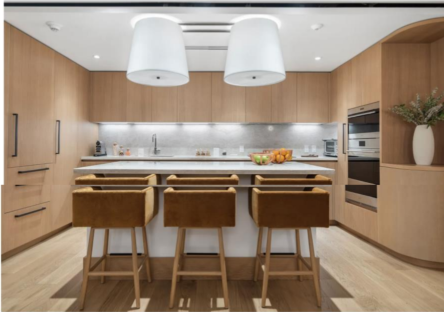
Wood and organic furnaces for THE WELL Bay Harbor Islands residence kitchens designed by Meyer Davis studio.

Common areas are designed as spaces to slow down and disconnect, focusing on yourself and your health. The Meyer Davis studio has superimposed transparent drapes on light, airy palettes to create ethereal atmospheres, while floor-to-ceiling lighting provides a balance of texture and natural light.