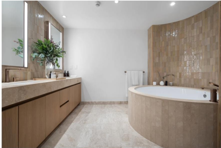
Master bathroom model of THE WELL Bay Harbor Islands residences designed by the Meyer Davis studio.

Construction work begins in Miami on the first holistic design condominium, an ambitious residential project that integrates architecture and wellness in 360 degrees. The inauguration of The WELL Bay Harbor Islands , which took place last October 9, marks a turning point in the real estate industry. AD meets exclusively with the protagonists of the project to understand how The WELL Bay Harbor Islands can revolutionise the way people live and work, integrating well-being into everyday life. Construction is expected to be completed in 2025.