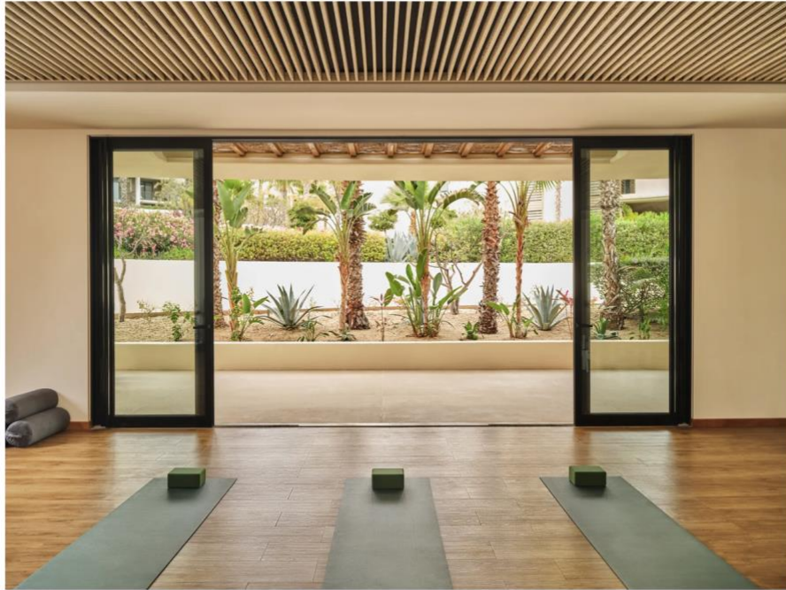
Natural materials, sandy palettes and holistic design are the characteristics of The Well clubs. Yoga room at Chileno Bay.