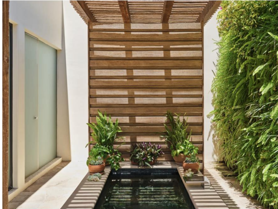
Organic shapes, natural palette, holistic design are the characteristics of The WELL clubs. The courtyard of one of the rooms at Chileno Bay.

The key elements of the architecture designed by Arquitectonica are generous and bright housing units that privilege flexibility and freedom of movement.