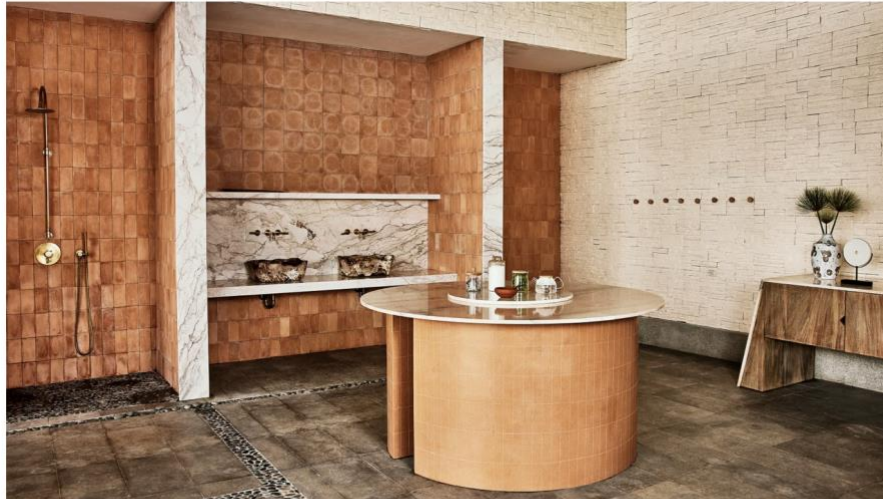
Natural, raw materials, sandy palettes and holistic design are the characteristics of The WELL. Wellness center at Hacienda AltaGracia.