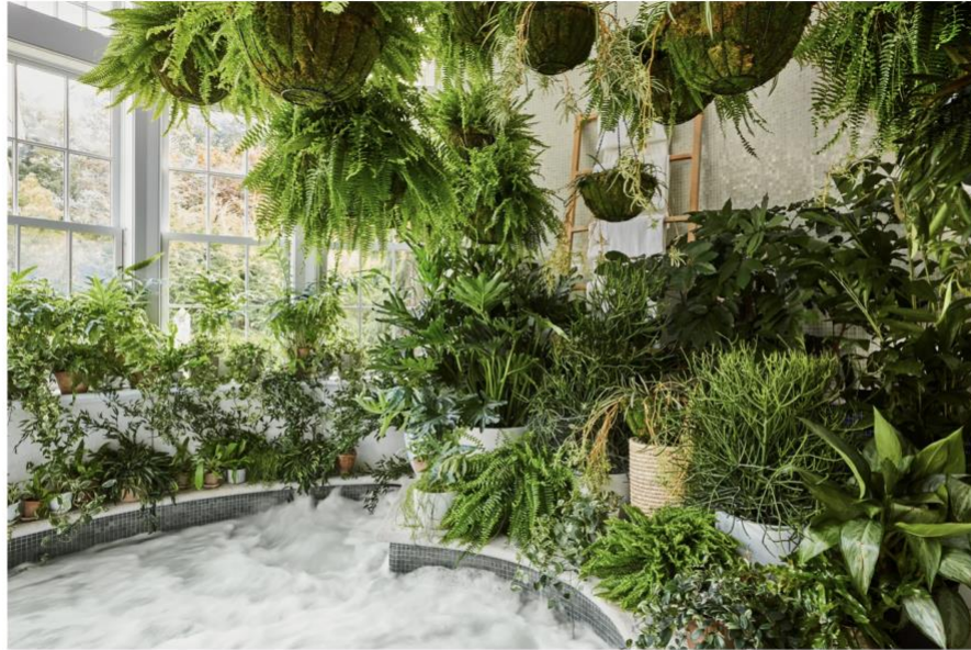
Nature becomes an integral part of the holistic design of The WELL clubs. Above wellness center at THE WELL at Mayflower Inn.

The atrium is filled with natural light, with high ceilings and open, airy design. Aromatherapy and the noise of the central fountain enhance the holistic atmosphere. The building has earned the Florida Green Building Design certification, which emphasizes sustainability. All residents of The WELL Bay Harbor Islands community will have full access to The WELL Club.