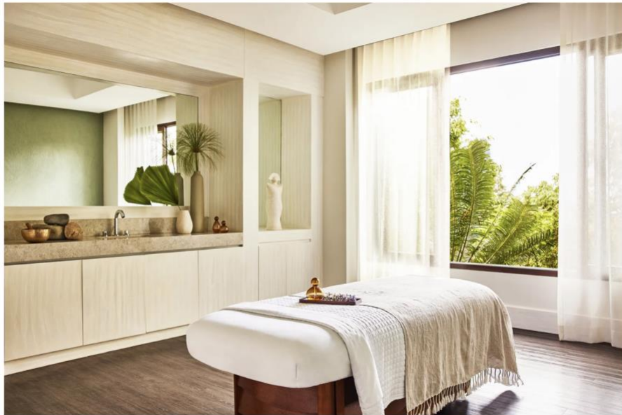
Organic shapes, natural palette, holistic design are the characteristics of The Well clubs and the elements of the upcoming THE WELL Bay Harbor Islands . Above one of the wellness rooms at Hacienda AltaGracia.